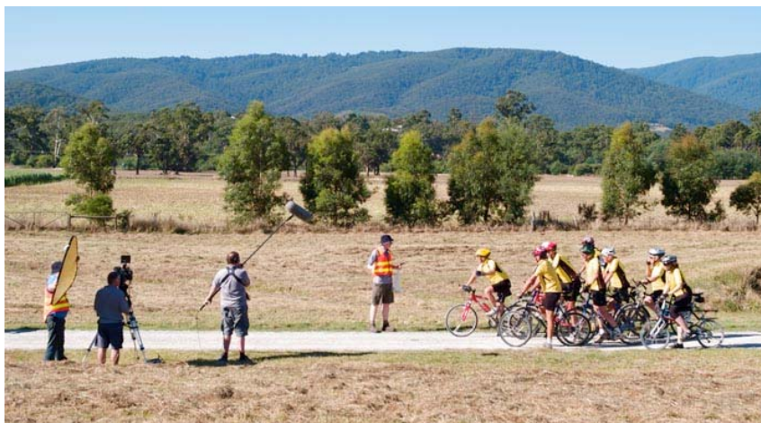
Setting up for the famous “Banana Battle Scene” near Woori Yallock

A few selected images taken on Thursday 18th Feb during the filming of “On Your Bike” TV Show