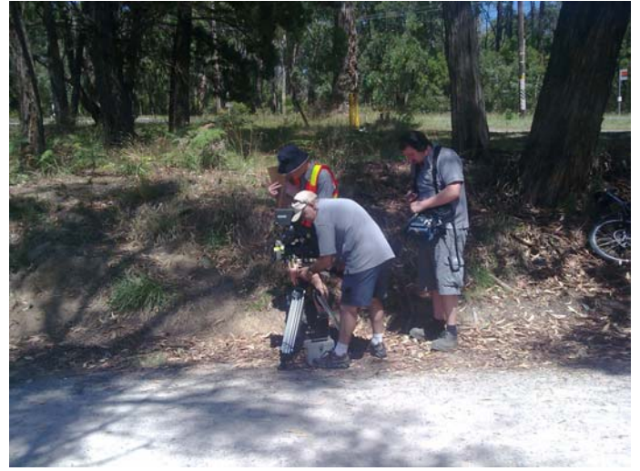
Setting up for filming near COGS at Mt Evelyn