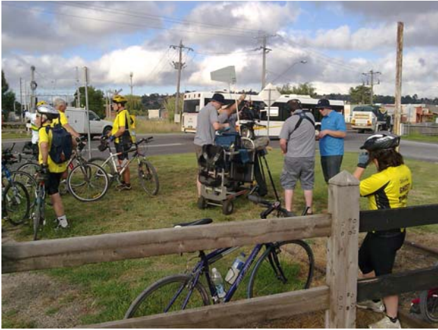
Gathered at the actual start of the Warby Trail at Lilydale Railway Station