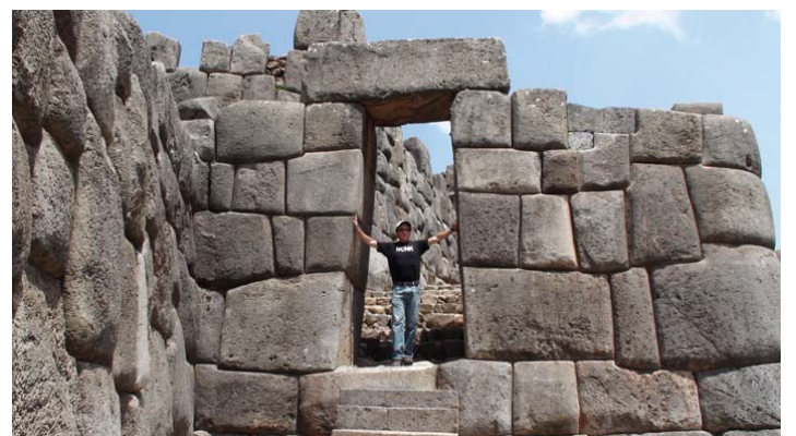
Part of the huge Inca complex at Sacsayhuamen (near Cusco). The person in the doorway was our guide Leo, surely one of the most educated and informative guides in the country.