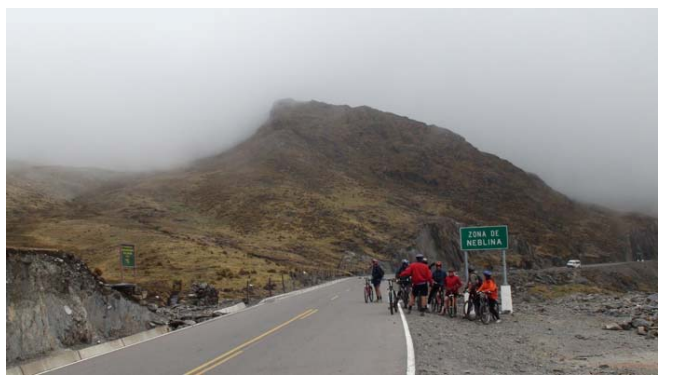
Gathered at the Malaga Pass, separating the Amazonian rainforest from the high and dry central plateau. (Approx 4300 metres).