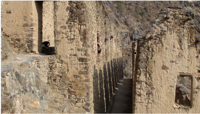
Can you see the Ghostriders hiding in this Inca ruin high above Ollantaytambo ?