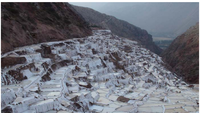
Ancient salt pans of Maras. Seldom seen by tourists and unchanged since pre-Incan times.