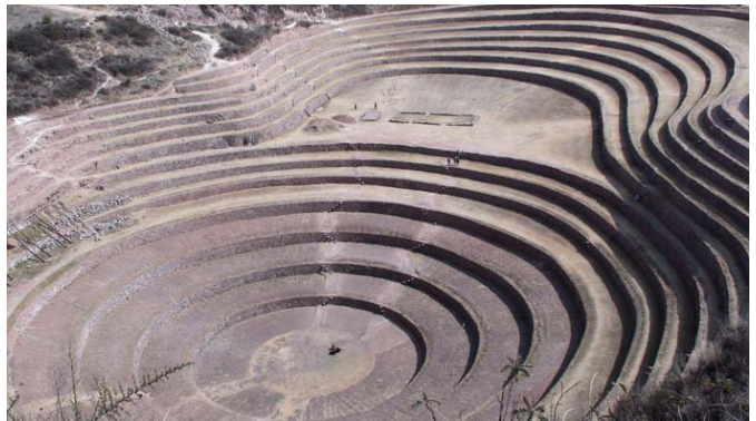
The incredible circular terraces at Moray. The scale can be gauged by the diminutive figures at the top. Each terrace has its own micro climate, allowing different crops to be grown.