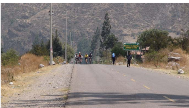
Riding along quiet roads near the Rio Urubamba (at least they were quiet until the road was blocked by a noisy mob undertaking a strike)