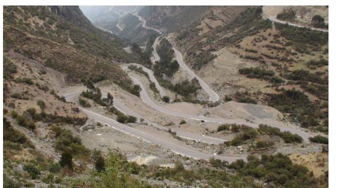
What a marvellous road for cycling. No cars and a beautiful sealed surface.