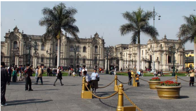
The impressive Plaza Mayor in central Lima