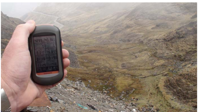
4300 metres high and a world away from Australia.