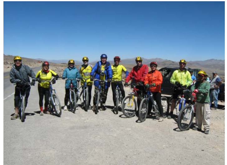
Ready for high altitude riding on the high plateau (about 4500 metres)