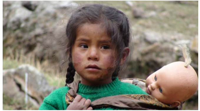
This young villager was somewhat surprised by the arrival of lycra clad riders in her town.