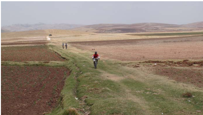
How about this for some fantastic remote cycling (altitude 4300m)